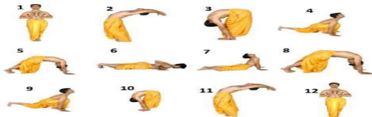
Figure.4 Block diagram of embedded kit