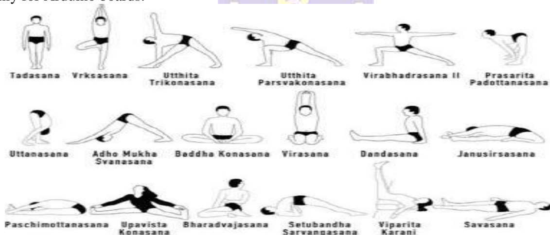
Figure.1 Sample yoga postures

This system primarily relies on four different types of sensors. DHT-22 (Humidity and Temperature sensor), ADXL-345 (Accelerometer) and a heart rate sensor are included in the sensors (HRM-2511E) The board used to link the sensors and transmission module was an Arduino Nano with an ATmega 328 microcontroller. Android phones with Bluetooth modules can connect to the kit through a Bluetooth module (HC-05). In Fig 2, you can see our prototype embedded kit. This kit's figure is a prototype; the creators want to replace it with an Arduino Nano model, which will be even smaller and less expensive. Its simplicity, versatility, and cost-effectiveness make it a better option for embedded systems than more complex and expensive systems. The ability to run source code more quickly on the hardware is another benefit of utilising Arduino. There are no third-party applications or code conversions to worry about when developing Arduino code on the Arduino's native IDE, which was built only for Arduino boards.