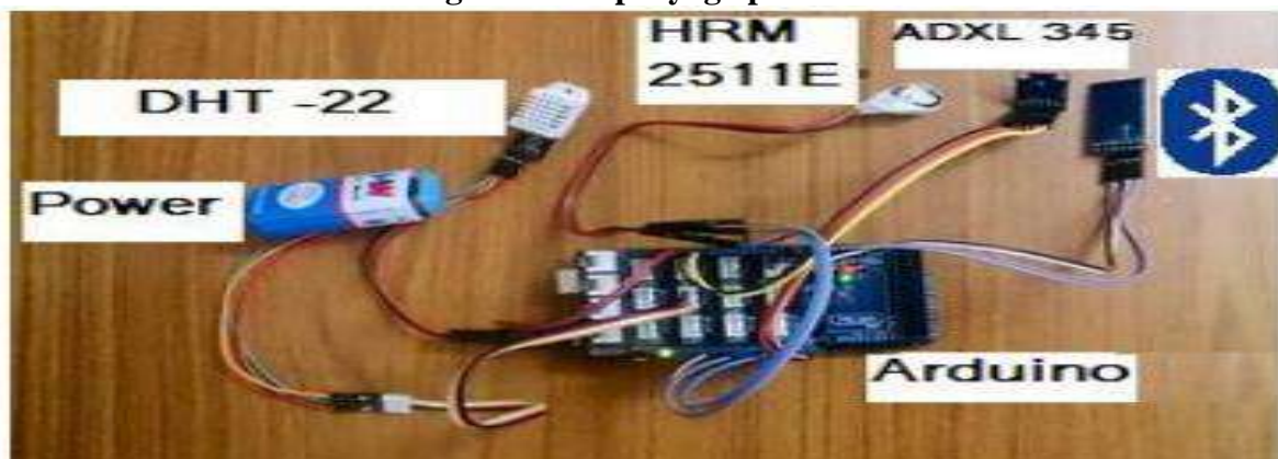
Figure.2 Prototype embedded kit

In order to receive and handle the data from the constructed system, an android application (Fig