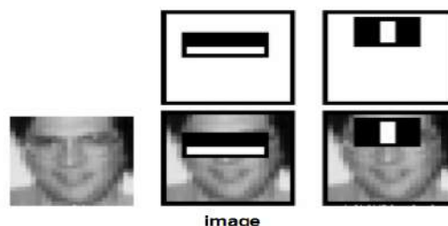
Fig 3. Haar Features